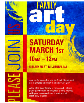
FAMILY ART DAY