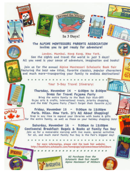
ANNUAL SCHOLASTIC BOOK FAIR