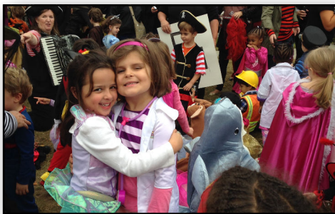
Halloween Parade: Students dressed as their favorite characters at this year's school parade. Parents joined the fun and also enjoyed crafts and treats during the classroom parties.

The primary focus of the Association is to create a positive and welcoming environment for parents and families, support the school's teachers and staff, and provide an enriching atmosphere for students. All parents of the school are members of the Parents Association.